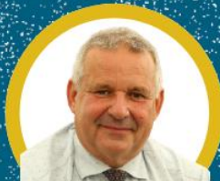
VLADIMIR PISKAY (SK)